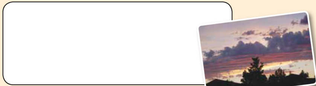
Picture perfect sunsets...

Fairmont RV Park 1700 Fairmont Rd. Anaconda, MT 59711